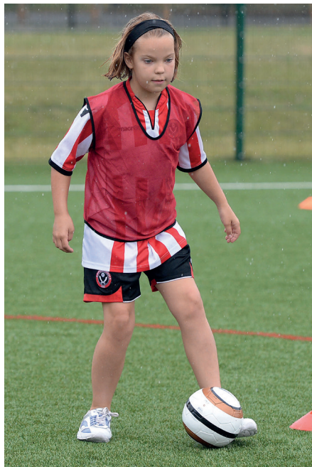
normal colour vision