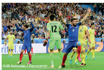
normal colour vision