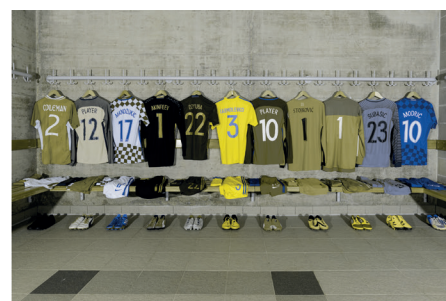
severe red deficiency