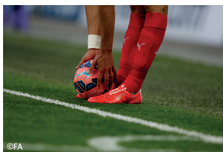
normal colour vision