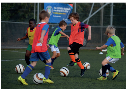
normal colour vision