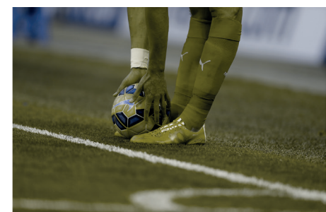
severe red deficiency

For more information and resources see www.colourblindawareness.org Guidance link http://www.uefa.com/insideuefa/social-responsibility/news/newsid=2498333.html