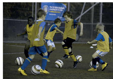
severe green deficiency