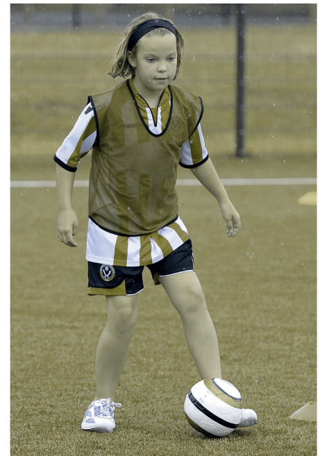
severe green deficiency