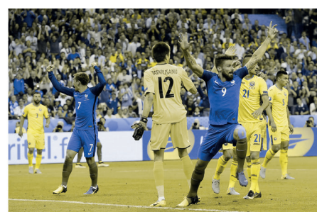
severe red deficiency