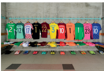
normal colour vision

Statistically, one player in every male squad