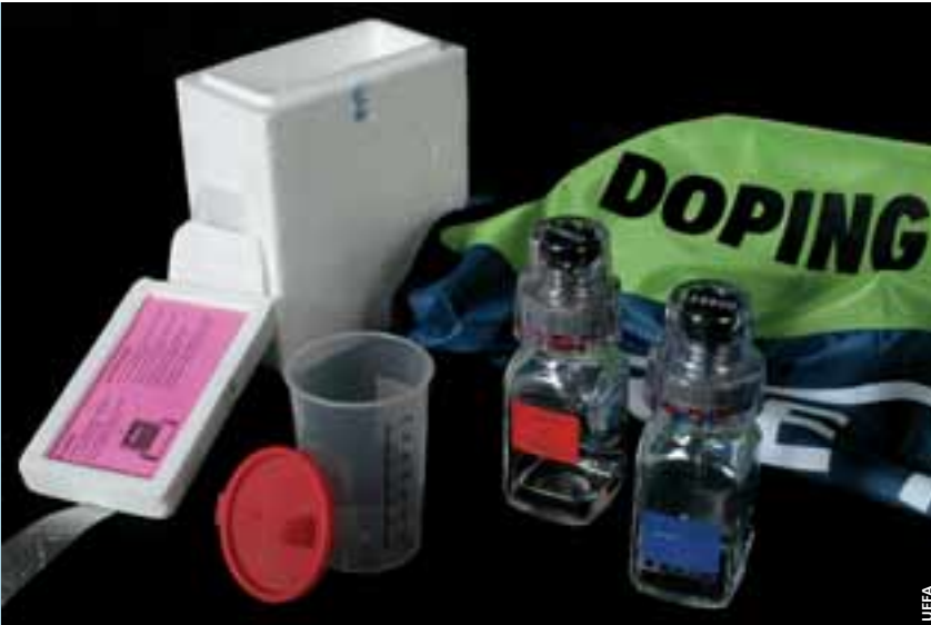
UEFA's doping control equipment.