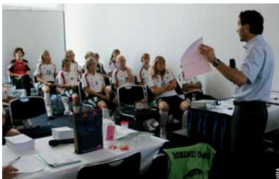
Doping awareness sessions are now carried out in conjunction with the UEFA youth competitions.

Last season, no fewer than 512 of the 546 applications were via the abbreviated TUE form related to the inhalation of certain Beta-2 agonists (salbutamol, salmeterol, terbutaline, formoterol) to treat asthma or the use of glucocorticosteroids by non-systemic routes (which remain detectable for a con-